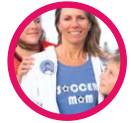
AT THE PARK