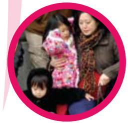
AT THE GAME