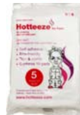
1 pack contains 10 pads